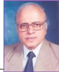
MS Swaminathan Papa of Green Revolution in India