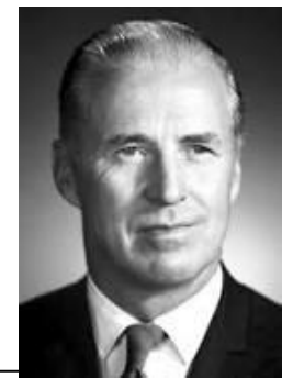
Ernest Borlaug Papa of Green Revolution